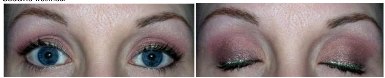
Girlfriend Michelle all over, Wildflower in the crease and foiled on the lid, Masquerade wetlined.

Sun Goddess all over, a mix in the crease (I think it was Blush Pearl and Flowers), Coconut Palm foiled on the lid, Socialite wetlined.