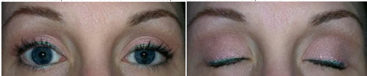
Cultured Pearl all over, Bloom in the crease, Antique Pearl foiled on the lid, Purrfect wetlined

Gold Leaf all over, Radiant Rebecca in the crease, Finesse foiled on the lid, Loli wetlined.