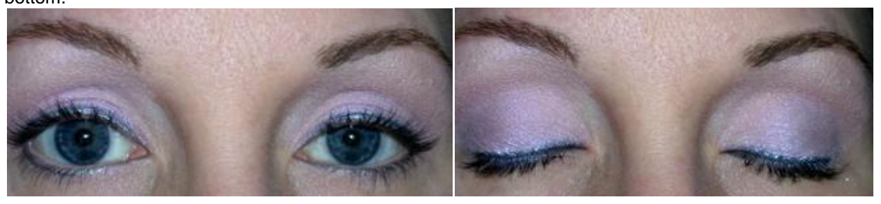
Lemonade all over, Azure in the crease, Girlfriend Kathleen foiled on the lid, Azure wetlined on bottom, Denim mixed in with that and wetlined on top

Free Spirit lightly all over, Ecstasy over that, Free Spirit in the crease and foiled on the lid, Liberty wetlined top and bottom.