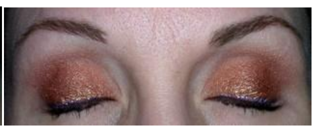
Pink Sands, Passion, Mermaid