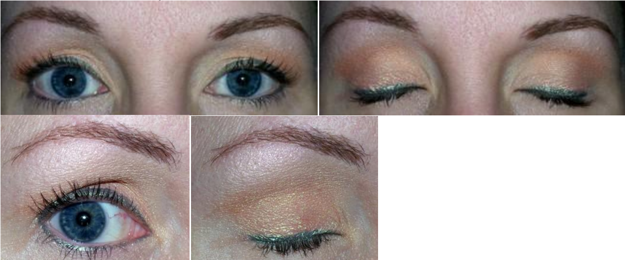
Gilded Taupe, Fantasy, Fling

Firelight all over, Fire Opal in the crease and foiled on the lid, Beach Goddess wetlined on bottom then Rio mixed in with that and wetlined on top.