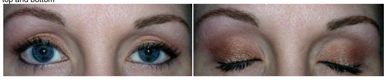
Hot Spot all over, Sincerely Renee in the crease and foiled on the lid, Intuition wetlined top and bottom

City Lights all over and then Winter White over that, Fun in the crease, Beautiful Autumn foiled on the lid, Rio wetlined top and bottom