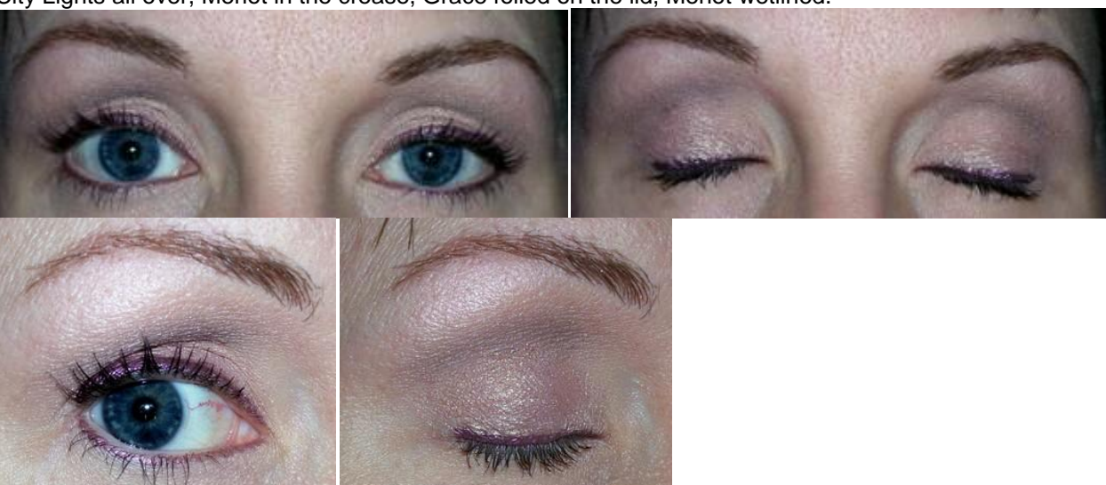
Sun Goddess added over all

City Lights all over, Merlot in the crease, Grace foiled on the lid, Merlot wetlined.