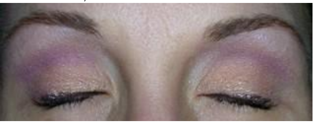
White Gold all over, Gold Dipped foiled on lid, Vine on outer 1/3 of lid, Green Tea and Blue Ball mixed to wetline.